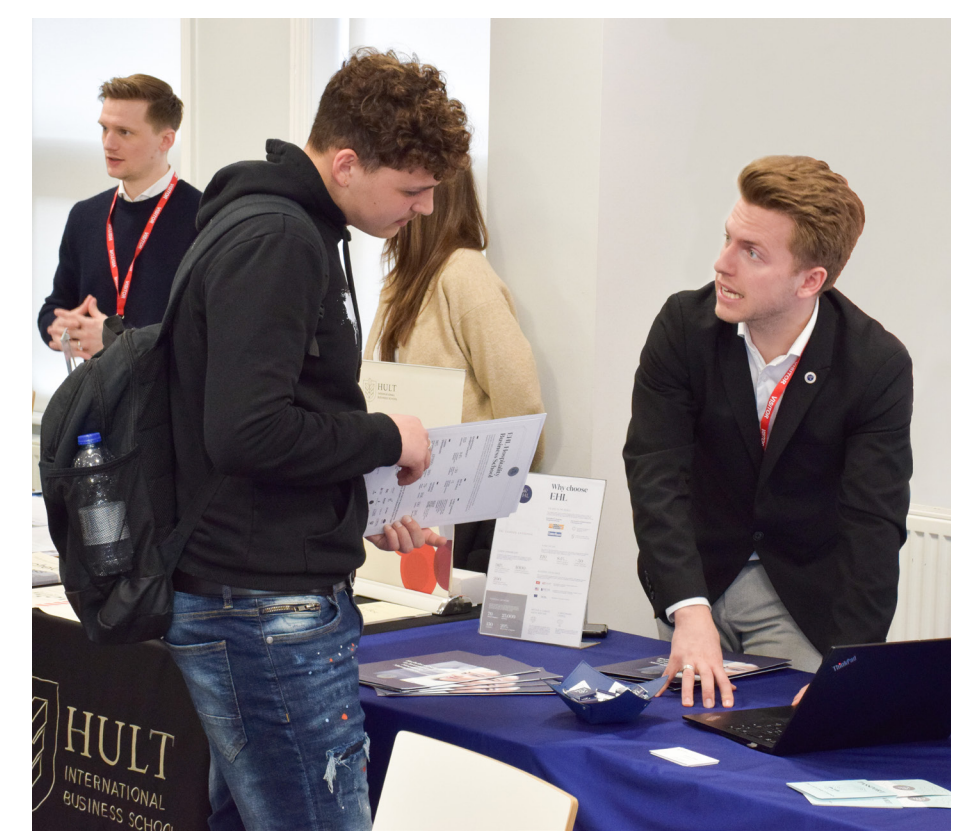
Annual HE Fair